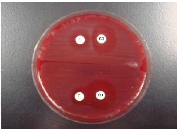
Figure 1: Two E-Resistant GBS isolates with a positive (upper half) vs negative (lower half) D-test result.